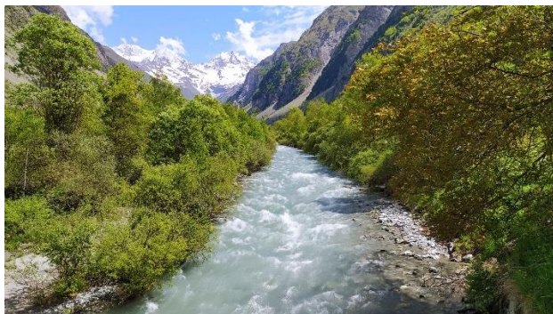
The Séveraise river.

In a plebiscite manner the 4 th edition of this particular workshop offers juniors to i) present and discuss , and ii) hands-on practice of various measuring principles in a setting that gives more opportunity to learn and to share compared to regular conferences.