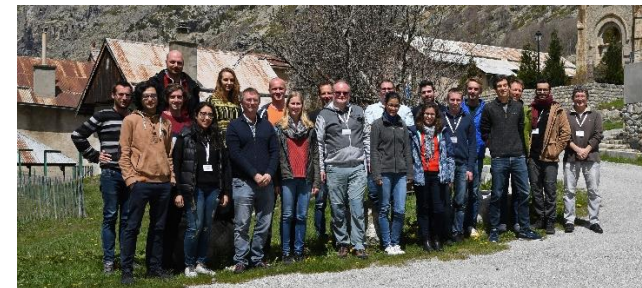
Participants during the EJSW 2019 edition in La Bérarde.

The 25 th EJSW will not only offer junior scientists an opportunity to present their research work and to be trained in chairing sessions as usual EJSWs, but will also put forward a unique set of practice sessions lead by the Organising Committee.